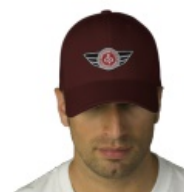
Maroon ball-cap with red embroidered MCR logo