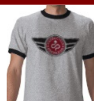
Black & gray ringer T-shirt w/basic red MCR logo