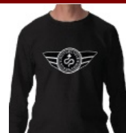
Long sleeve black shirt with black MCR logo

A sample of some of the items available at the New MGR Store