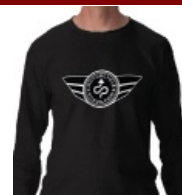
Long sleeve black shirt with black MCR logo

A sample of some of the items available at the New MCR Store