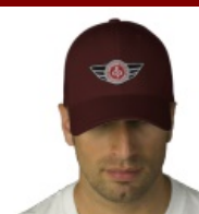
Maroon ball-cap with red embroidered