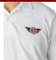
White polo shirt with red MCR logo