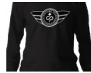
Long sleeve black shirt with black MCR logo