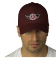
Maroon ball-cap with red embroidered MCR logo