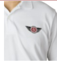
White polo shirt with red MCR logo