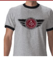
Black & gray ringer T-shirt w/basic red MCR logo